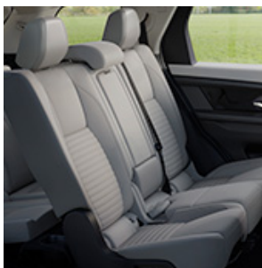
SEATING AND INTERIOR TRIM