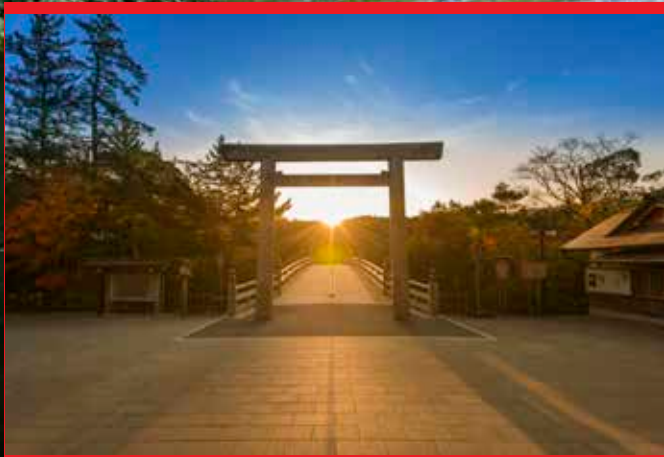
THE ISE GRAND SHRINE ALONG ISUZU RIVER

The name 'Isuzu Motors Limited' was adopted in 1949 and we remain committed to driving the economies around the world forward far into the future.